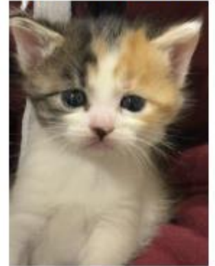
Safe and Sound

Beginning in April, there will be a GiveBIG donation link available on our website, www.meowcatrescue.org , or your GiveBIG check may be sent anytime.