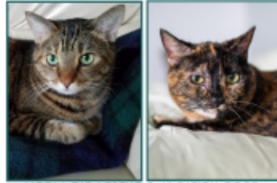
MEOW CAT RESCUE & ADOPTION 2025

Every year we commemorate several of our rescue stories in our 12-month calendar. It's a wonderful way to be reminded that there are indeed happy endings.