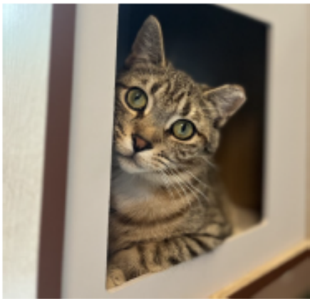
Eugene Looking Pensive

Sweet and watchful Eugene came to MEOW from a colony in rural Concrete. As the sole survivor of his litter, without the intervention of a kind stranger he surely would not have made it either. Tiny