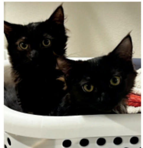
Nutty Pecan and Peanut

One month into treatment, they are also showing positive signs of recovery. MEOW believes all nine lives are precious and every animal deserves a second chance. Finally, cats with FIP have that chance too.