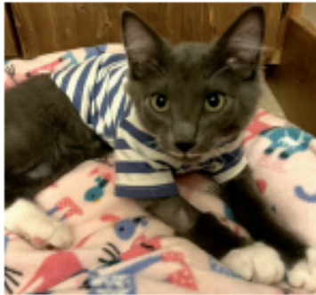
Tom On the Mend

Tom and Jerry were tiny kittens fending for themselves outdoors, when their luck changed - a kind person took them in. Unaccustomed to human contact, it took a leap of faith for them to respond to their rescuer's care. From scared and hissing, Tom and Jerry began to realize people weren't so bad after all, and even started to enjoy their company.