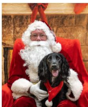
Santa & Friend

Commemorate this holiday season and support the animals of MEOW with a picture of your pet, your children, (and you?) with Santa. For a $20 donation you will receive a printed photo on site and access to online digital images. Safety first, so pets must be restrained,