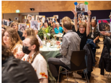
Showing Off Our MEOW Alumni Bid Cards

If you were in attendance, we'll be sending out a survey to get your feedback. If you weren't able to attend and would like to watch our Mercy Fund video and meet a few of the very special animals whose lives have been touched, you may access it with the QR code here. And, we hope you'll be able to join us next year.