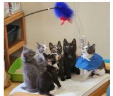
Curious Foster Kittens

medical supplies available for human hospitals. Spay/neuter surgeries were classified as non-essential, which caused an explosion of litters of puppies and kittens. When once again allowed, limited