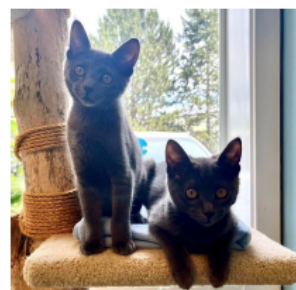
Cottage Welcoming Committee

staff and new safety restrictions greatly reduced the number of surgeries which could be performed. Shelters in our region, as well as across the country, are seeing more kittens and unaltered adult cats than we've seen in years. We're hopeful that adding an additional day to our open schedule will allow more potential adopters to visit us, and will result in more of our deserving kittens and cats finding their forever homes.