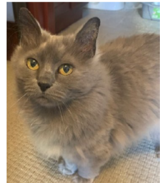
Ready for a Chat