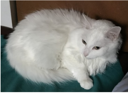
Glacier Safe & Warm