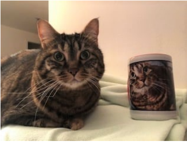
Ms. TT—A Purrfect Cup of T

Tiger Tinsel came to us as a 3-month-old kitten back in 2013 after being found abandoned along a river in Orting. She and her new MEOW “sister”, Stella, were adopted quickly, but