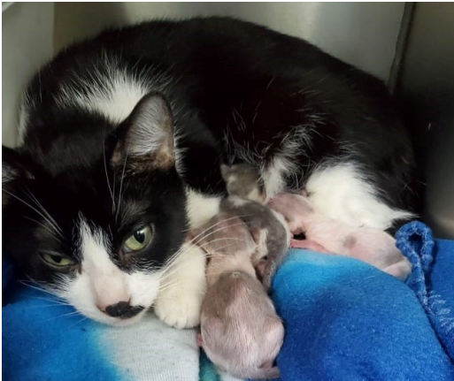
Sweet Mama Zoie

Moms hold an incredibly special place in our hearts, whether they are human moms with two-legged or four-legged children, or furry moms. This year during giveBIG, we'd like to celebrate Mother's Day and honor these amazing mothers. When you donate a gift of $250 (or more) in honor of a Mom, her kitty (or your kitty) will earn a small photo square in our 2022 calendar, while they last. We'll also send the human moms being honored a special email to let them know that you were thinking of them.