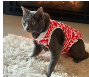
Looking Good, Bug

June Bug and her siblings were roly-poly kittens with round tummies and fuzzy bodies – the epitome of adorable. These babies, healthy and happy, were placed in a foster home where they were bottle fed