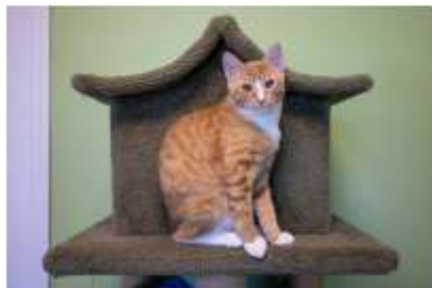
Jerry — Young at Heart

His name is Jerry but everyone calls him Jerbear! This handsome guy is a young 15. He was surrendered because his owner moved into assisted living where she could have only one pet, and she reluctantly chose his brother. Since he's been at the shelter, he's had a dental with some extractions and has no immediate medical concerns. Jerry has always been an indoor cat and, in fact, the great big world quite overwhelms him. If a crowd gathers you're likely to find him seeking quiet refuge under the nearest bed. Jerry grew up with one other cat and lots of dogs. Dogs are fine with Jerry unless they chase him. He has very good litter box manners, although he has been known to "wet his pants" if he gets very frightened. Favorite things: he enjoys roast chicken cut in small pieces and he absolutely loves sitting in a lap while someone reads a book. Jerry is known for his wonderfully loud purr, especially when getting neck scratches.