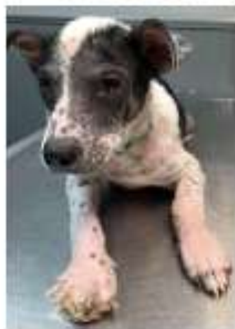
Blossom—Tiny but Mighty

Blossom, just four months old, arrived from Houston just a few weeks ago, her skin raging with demodex mites and with a mysteriously enlarged and deformed right paw, issues that often result in dogs in that part of the country being deemed "unadoptable". Since her arrival she's been getting medicated baths daily to treat the infection and