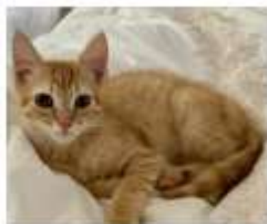
Thor—God of Strength