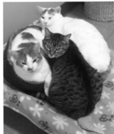
Chloe, Ginger & Chrissy

None of these girls will require your undivided attention. You may not even notice them at times as they are a bit shy and more into each other than humans. But, they're young, love toys and as they get comfortable with you, will love you as well. If you have room in your heart and home for three cats who won't be in your face, and will be each others' best friends, please come meet them. We're hoping there is someone out there with enough love in their heart, and a big enough bed for all three of these wonderful girls.