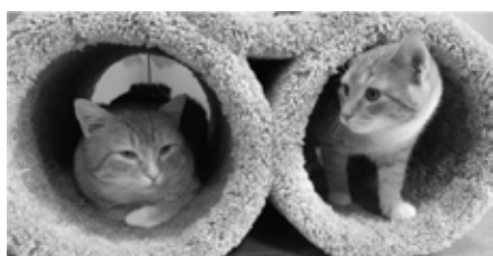
Major Tom & Ziggy Stardust

The snow has long since covered the dirt road leading to the empty house outside Pullman. Thanks to the efforts of one "dog person", all these young cats will go on to live each of their precious nine lives.