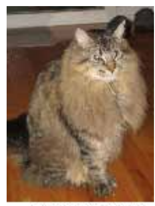
Grown up Chance

It's been more than a year since they arrived at the animal emergency clinic. They were so thin and frail, shivering and dangerously weak. The effort of holding their heads up was almost too much for their tired little bodies. If all of this wasn't enough, their eyes were badly infected and sealed closed—they had to be gently massaged with a warm, soft cloth in order to get them open. They would require intensive round the clock care. Were we up for the challenge? You bet we were!