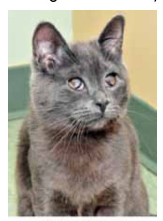
Shar so sweet

At six months old, these two sisters act like other kittens their age. But their story is a little different. A few months