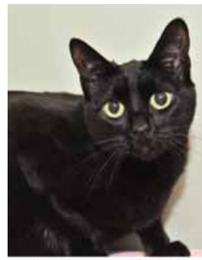
Hoping for a home

"May you have enough happiness to make you sweet, enough trials to make you strong, enough sorrow to keep you human, enough hope to make you happy." ~ Anonymous