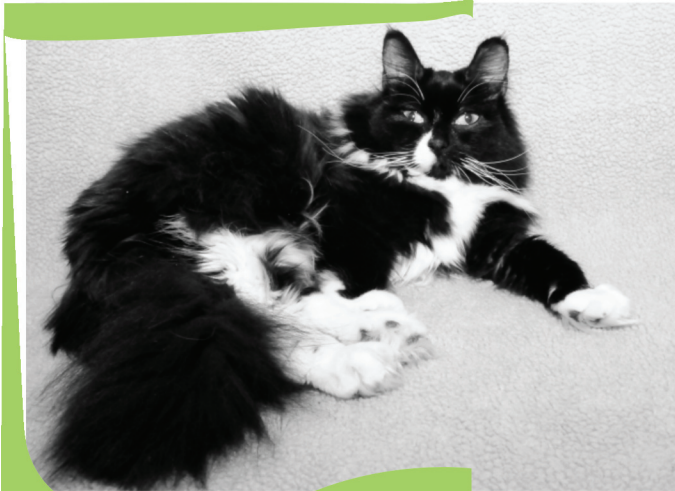
The amazing Gizmo

Gizmo was rescued two years ago from a life of physical abuse, the details of which are too horrific to share. Since then he's been lovingly cared for by a Seattle woman. MEOW was asked to take him when his behavioral issues, assumed to be caused by the previous abuse, became too much for his savior to handle. Despite everything, Gizmo is holding it together.