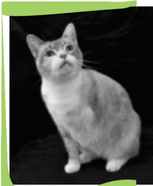
Sweet lady Mango

It's me, Mango. I grew up in Eastern Washington with a nice lady. She let me outsidies during the day and that is pretty much where my troubles started. One really cold day I was sleeping in a warm cozy place and somethings horrible happened. A big noise – and then a big hurts. My lady took me to a vet doctor. They figured I got caught in a Car fan-belt thing. My lady did not have much moneys so she had to give me to the vets so they could save