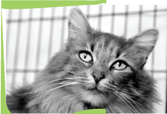
A cheery Winter

Late last Fall, a small blue gray tabby cat began peeking out of the bushes at a feeding station near the Kirkland McDonalds. Finally, on a cold and rainy night just after Christmas, she introduced herself to her caretaker. Although she had been sharing meals with the feral cats, once she was safe inside at MEOW, this 1-year old beauty revealed that she is not only tame, but exceptionally loving, in spite of the fact that life has been very unkind to her.