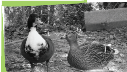
The happy couple, Malcolm & Mallory

For several years, MEOW has been hosting a bonded pair of Mallard ducks throughout the Summer months. They arrive in Spring and then go south in the Fall. Malcolm and Mallory