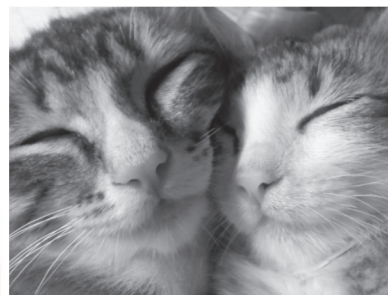
A Gremlin cuddle

We were shocked to learn that the five tiny creatures with enormous ears and oversized eyes were actually eight weeks old. They were half the size expected for kittens of that age.