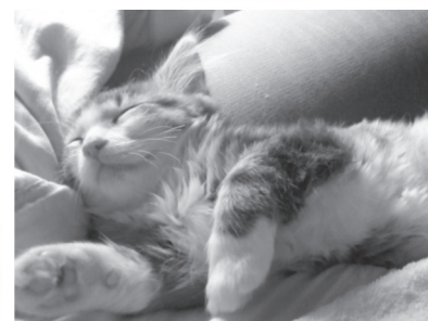
Sleepy Gremlin Iris

The early starvation and malnutrition they had suffered was wreaking havoc on their tiny bodies. In their twelfth week, two of the kittens required hospitalization. Andy and Gracie both had internal infections and, to make matters worse, Andy was diagnosed with a heart murmur. Yet despite their significant challenges, they continued to eat and play and study at kitten school.