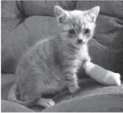
Dickens cute as can be

It was late in the day. A woman walked her dog along a busy road in Monroe lit only by the headlights of passing cars. Suddenly the dog stopped and looked into the ditch. Something down there had moved. A tiny kitten, no more than seven weeks old, was struggling to stand. In all likelihood, he had been discarded like trash, thrown into the ditch from a passing vehicle. The woman put the tiny bundle into her sweater and hurried home.