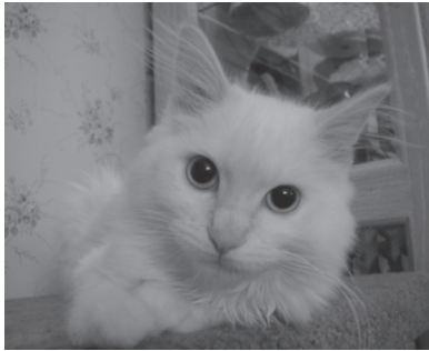
Rumor has it all!

She's a beautiful kitten. Her white coat is soft and fluffy, her ears and tail are shaded the pale color of orange sherbet, her blue eyes sparkle. In both her looks and personality, she resembles a CreamPoint Ragdoll.