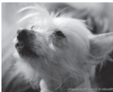
Betty aka Esmerelda