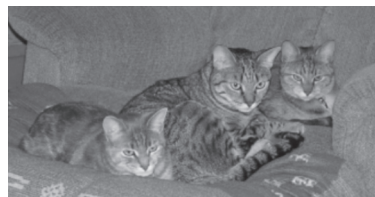
Read about Cliff, Dora & Honey

It's all about the happy endings! We have so many great stories to share about kittens and puppies, cats and dogs, some getting their second, third or even fourth chance for a safe,