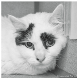
Lovely Hsiu Mei

Nelly, 13, and Sherman, 11, are a bit shy. Nellie warms up quickly, especially if the introduction includes catnip. When her cheeks and ears are rubbed she chirps a happy meow. Brother Sherman looks to Nelly for comfort and security. He loves to watch the outside world from the windowsill. They will do best in a quiet home with someone who will give them all the time they need to learn to love and trust again.