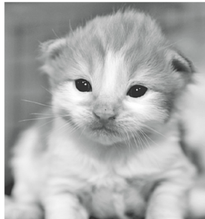
Looking forward ~ Baby 2017