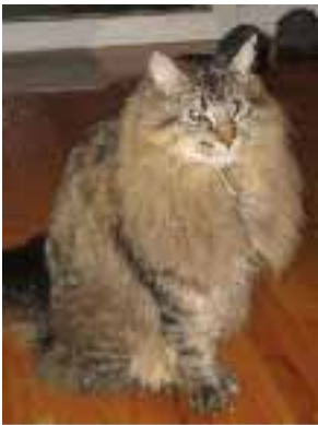
Grown up Chance

It's been more than a year since they arrived at the animal emergency clinic. They were so thin and frail, shivering and dangerously weak. The effort of holding their heads up was almost too much for their tired little bodies. If all of this wasn't enough, their eyes were badly infected and sealed closed—they had to be gently massaged with a warm, soft cloth in order to get them open. They would require intensive round the clock care. Were we up for the challenge? You bet we were!