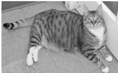
Alex aka Mr. Big

Alex is nearly 23 pounds, a big brown tabby hunka-hunka burnin' love. Looking younger than his ten years, he's working on getting that athletic body back.