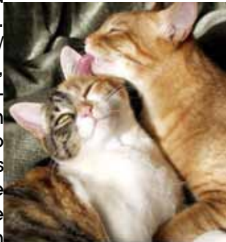
Dixie & Wiley lived in a feral colony

Whether you've seen them or not, they're out there. They're everywhere. They're slipping in and out of the green belt, peeking from under your neighbor's garden shed, living behind the car dealership down the street. That flash in the corner of your back yard may very likely be a community cat. Some of these cats are indeed feral, which means "existing in a wild state, not domesticated." However, many of the cats which can be seen in our neighborhoods and countrysides are not actually wild. They have known the benefit of human touch, and they crave it again. They belonged to someone once, but have somehow found themselves struggling to survive in this homeless world that has become their own. Perhaps they lived an indoor/outdoor life and lost their way, becoming a stray cat. Perhaps their human companion moved away and decided to leave them behind, in hopes that a neighbor might take them in. Many people hold the mistaken belief that cats can fend for themselves outdoors.