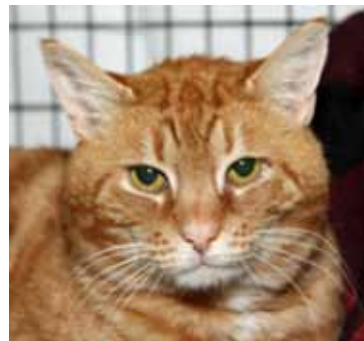
Flip ate at a local Mc Donald's

In this issue we'd like to introduce some community cats we recently welcomed into the MEOW family. These are a few of the lucky ones. They have been given shelter from the rain and cold, and medical treatment to heal their injured bodies. Their meager dumpster foraging has been replaced with fresh and nutritious regular meals. Their lives have been changed forever for the good, and all because someone noticed them. Someone saw something. Someone said something. Someone did something. They have been promised a future. Their joy is palpable.