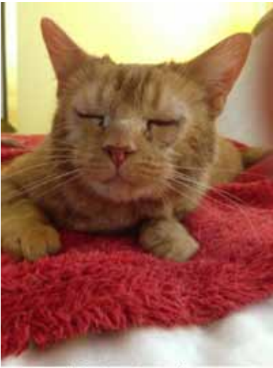
Hunter at naptime

In the woods above Sultan, the first five years of Hunter's life had been anything but easy. This round-faced red tabby gent grew up as a community cat, loosely owned by the man who was kind enough to put food out for the approximately ten cats who hung around. The man described Hunter as a survivor. Three years ago, a coyote or bobcat had taken the rest of his cat family, leaving