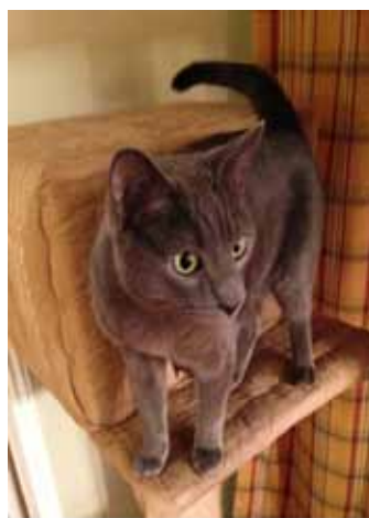
Heathcliff King of the cat Tree

Approaching the covered trap, the strong odor of infection was present. Bad sign. Lifting the towel, the trapper saw the pleading eyes of a thin, silver blue cat. He was most definitely tame. He was clearly in a lot of trouble. She took him straight to Clearview Animal Hospital, where she works.