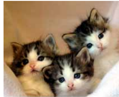
Skippy, Skidaddle & Skidoo born under a Kinko's

Anyone can help a community cat. If you notice cats who seem to not belong to anyone, ask for help. There are a good number of organizations and independent rescuers who are committed to making life better for these animals. Even cats who are truly feral can be helped by TNR, Trap-Neuter-Return, a process in which feral cats are altered and brought back to their home area to be fed by a caretaker, never again fighting for food or mating rights.