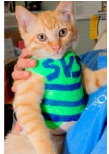
MEOW's soccer star

The surgery was scheduled. On December 14th, at Seattle Veterinary Specialists, in Kirkland Paolo's sternum was sutured to an external splint in an attempt to pull his soft kitten bones into a more normal formation. A few days later, KOMO-TV introduced Paolo to their viewers through a feature called People Helpers. Over the following several days, the response was tremendous and MEOW received donations to fully cover his surgery expenses.