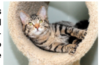
MacArthur enjoying some R&R