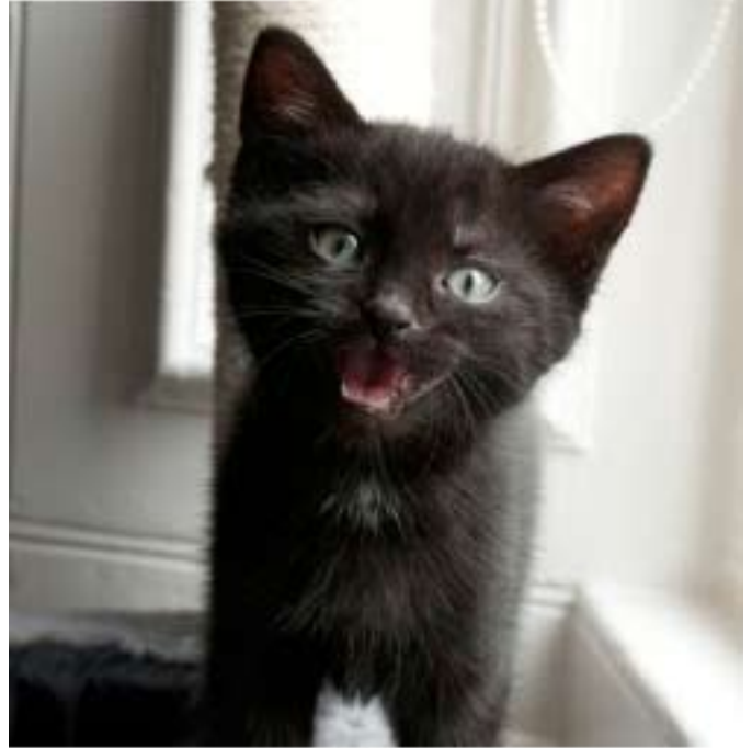
Fiona Cute & Quirky

To meet this quirky little kitten, please call the shelter to set up a "get to know you" date.