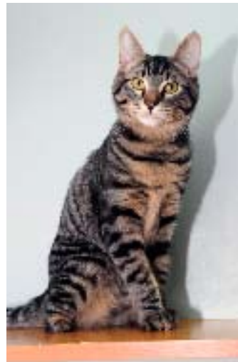
Sherman at full attention

Sherman and MacArthur spent much of their early lives being passed around from home to home via Craigslist. Both were born with one malformed back leg. Perhaps this was the reason nobody seemed able to make a commitment to these two adorable brown tabby brothers. The kittens, however, were blissfully unaware of their physical deformities.