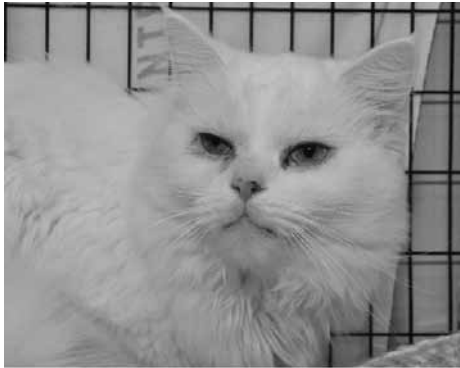
Happy, handsome Pete

years, the number of cats had grown unmanageable. The family had been unable to give away all of the kittens, which just kept on coming, litter after litter. The people were unable to afford the necessary spay/neuter surgeries to stop it, and now they couldn't even feed them all.