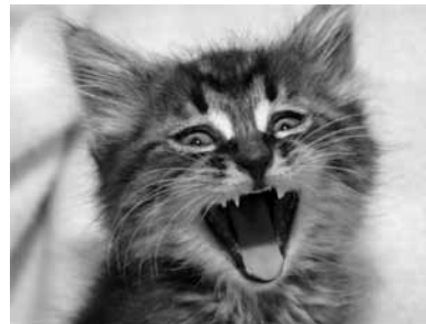
Have you heard the Mews?

We are so excited to announce the launch of our first email newsletter, MEOW MEWS. Our hope is to share the good things that are happening at MEOW with our volunteers, supporters and adopters in between our quarterly newsletters.