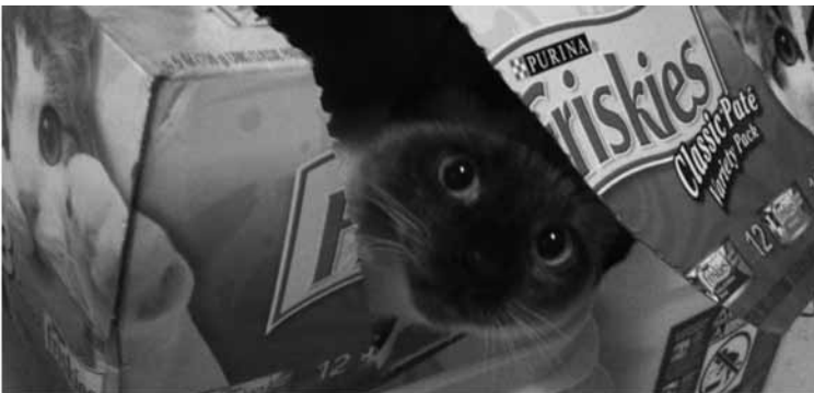
Is dinner ready?

Canned Kitten and Cat Foods (any) Kitten Kibble (esp. Royal Canin BabyCat) Cat Kibble (esp. Royal Canin Special 33) Baby Food - Gerber 2nd brand (meat flavors only, especially Chicken or Turkey) KMR formula (Kitten Milk Replacer) Cat Attract Litter Feliway (Comfort Zone) plug-in refills Copy paper Postage stamps Garbage bags – Kitchen size drawstring Paper Towels Hand Sanitizer Liquid Laundry Detergent New High Power Microscope