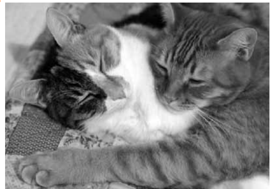
Everyone loves a snuggle