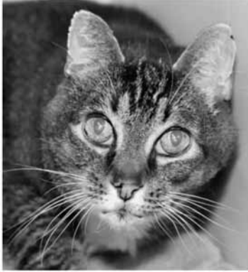
Handsome Marcus with the emerald green eyes

In February 1997, when MEOW was just coming to life as a rescue organization, perhaps Marcus was a newborn kitten or maybe he was becoming a young cat. Perhaps he had a loving family who adored him. What had happened to so reverse the circumstances of his life between then and the spring of 2009?