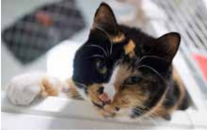
Miss Sweet Pea

Late last November a man called the shelter saying he had "too many cats" and needed to get rid of some of them. We asked him "how many is too many?"