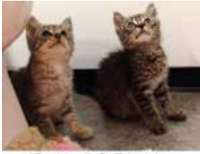
Swanzi & Beauty

Years ago, a MEOW volunteer was called out to trap feral cats near a dairy farm in Duvall. In fall of 2014, she returned to the same site, and found a pair of kittens hiding in the back of one of the stalls—feral, tiny, and just eight weeks old.