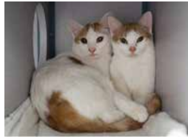
Ellie and Elliott or is it Charity and Charlie?

Last September, an elderly woman contacted MEOW asking for 15 spay/neuter vouchers. She explained that two years ago an orange and white cat had given birth under her deck and had since birthed three more litters. Vouchers were issued and carriers