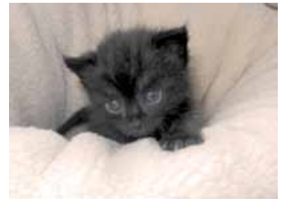
Gentry safe and warm

It was a crisp spring morning in Yakima, a perfect morning for a brisk walk. A man and his dog were enjoying the fresh, chilly morning air when the dog broke away to investigate something in the street.